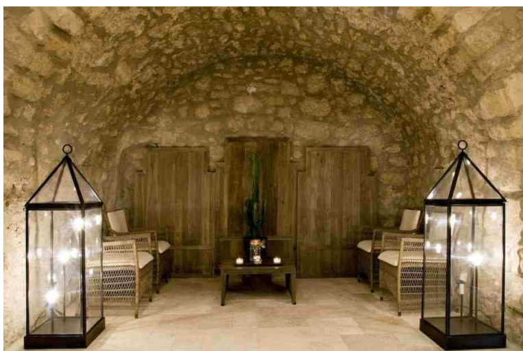
Tailor-made facial treatment

A perfect blend of treatments to experience a moment of pure beauty and well-being. We strongly recommend the relaxation session to help you fully enjoy your ritual.